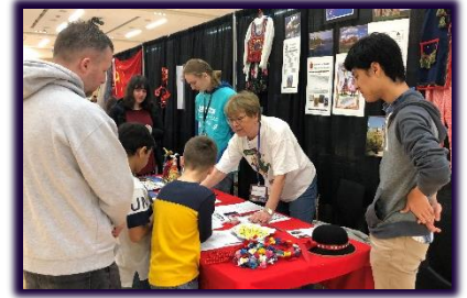
Polish Booth at 2020 FIUTS CulturalFest

The annual FIUTS CulturalFest took place on February 6, 2020. The Polish booth attracted many visitors who learned about Poland and Polish culture from students who volunteered their time to share their knowledge with the guests.