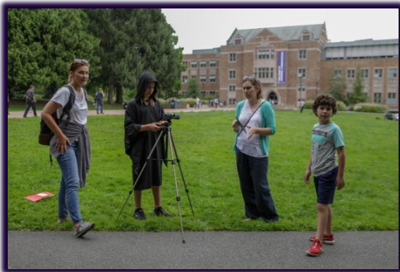
2019 ARCS Summer Camp